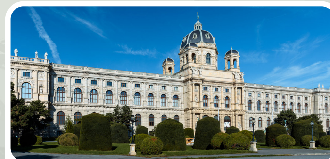
Natural History Museum